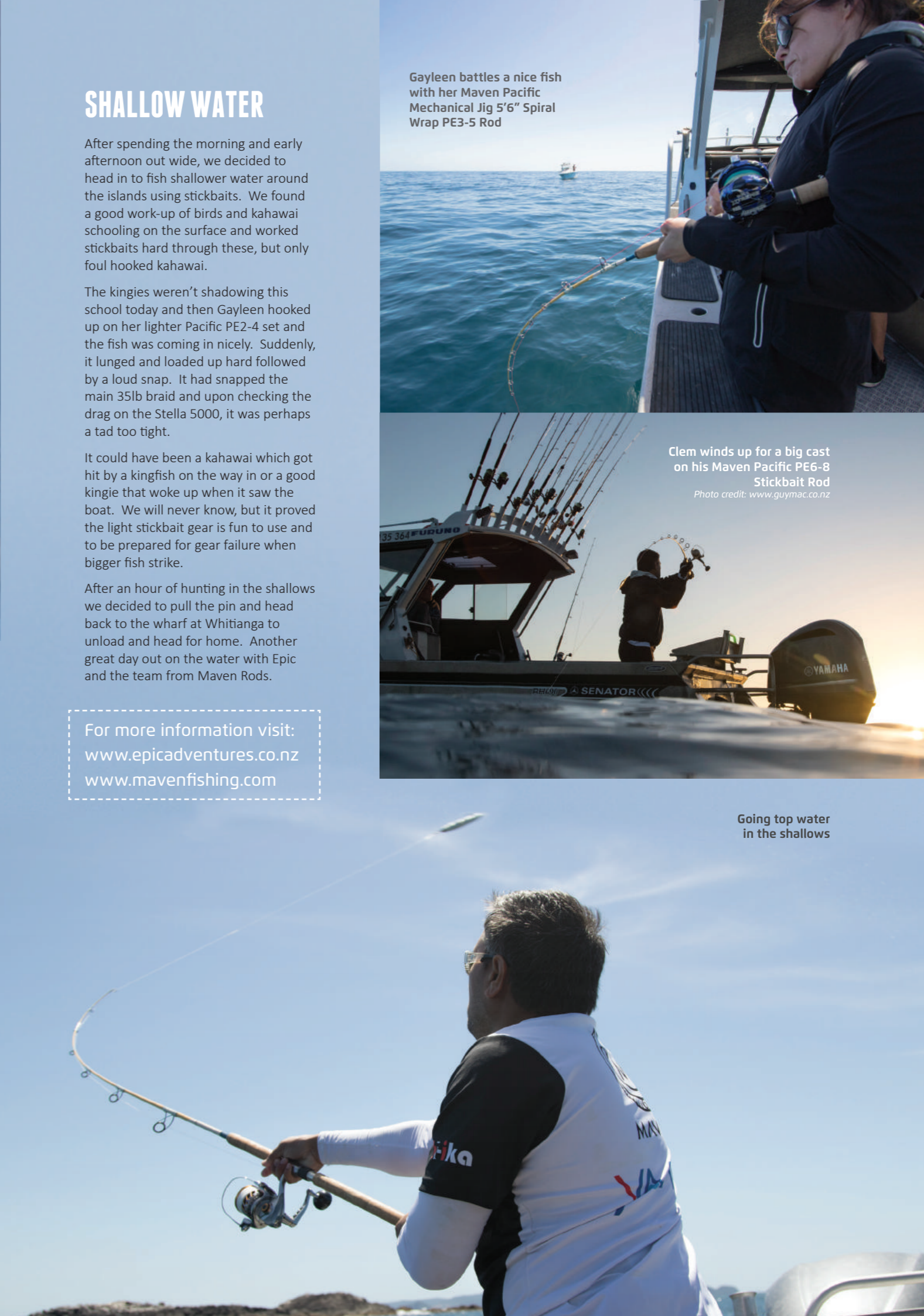
Going top water in the shallows

For more information visit: www.epicadventures.co.nz www.mavenfishing.com