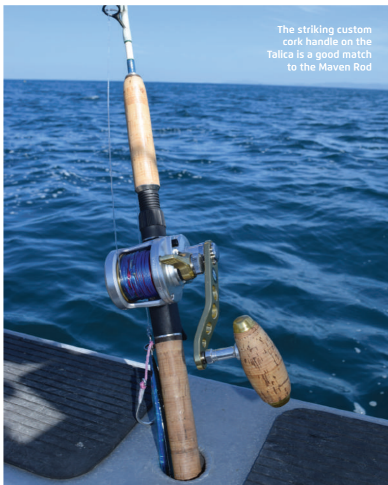
The striking custom cork handle on the Talica is a good match to the Maven Rod

Owen pointed out they commonly get marlin taking live baits over summer around the Aldermen Pins and while most fish were lost, a few had been landed.