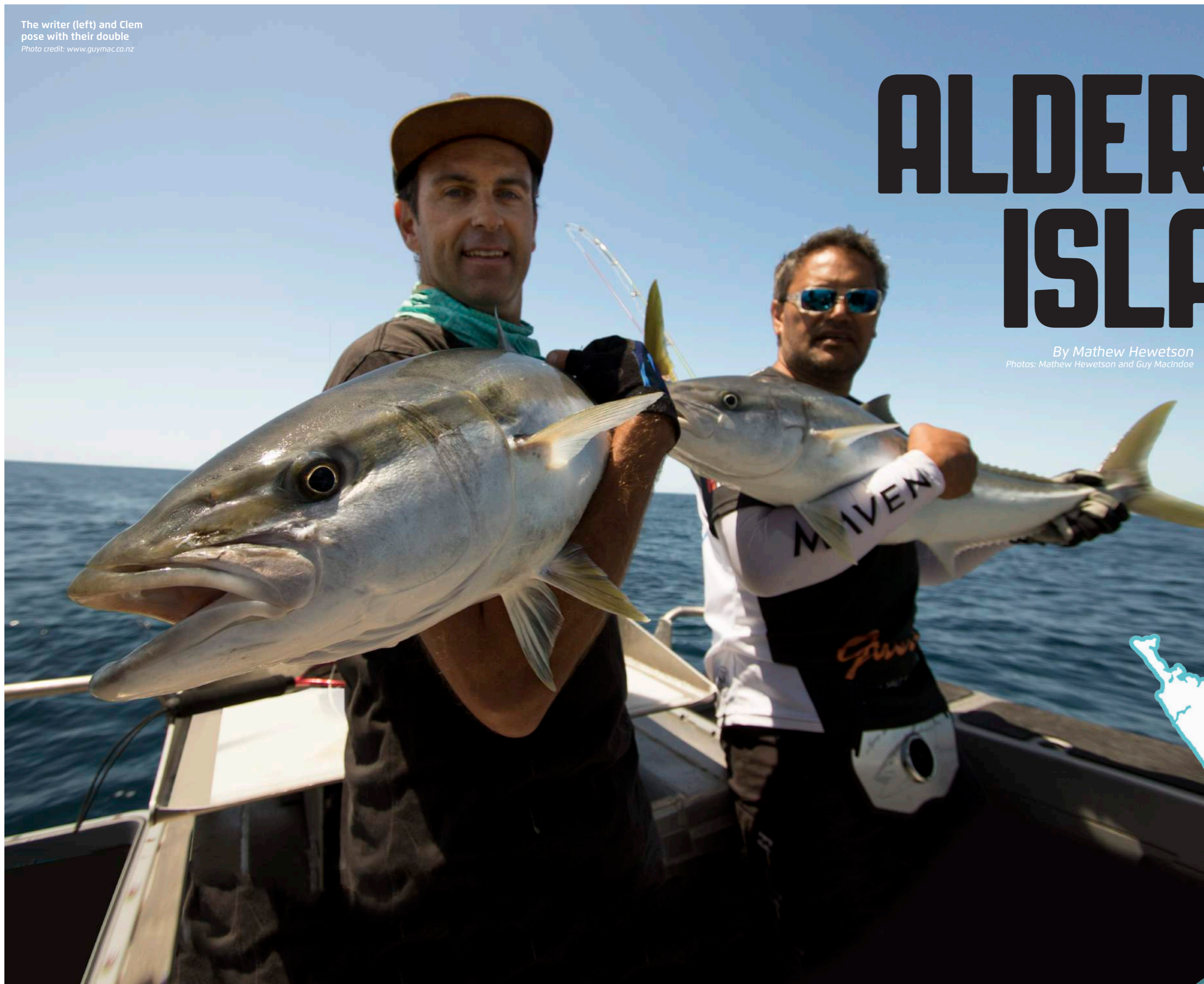
The writer (left) and Clem pose with their double