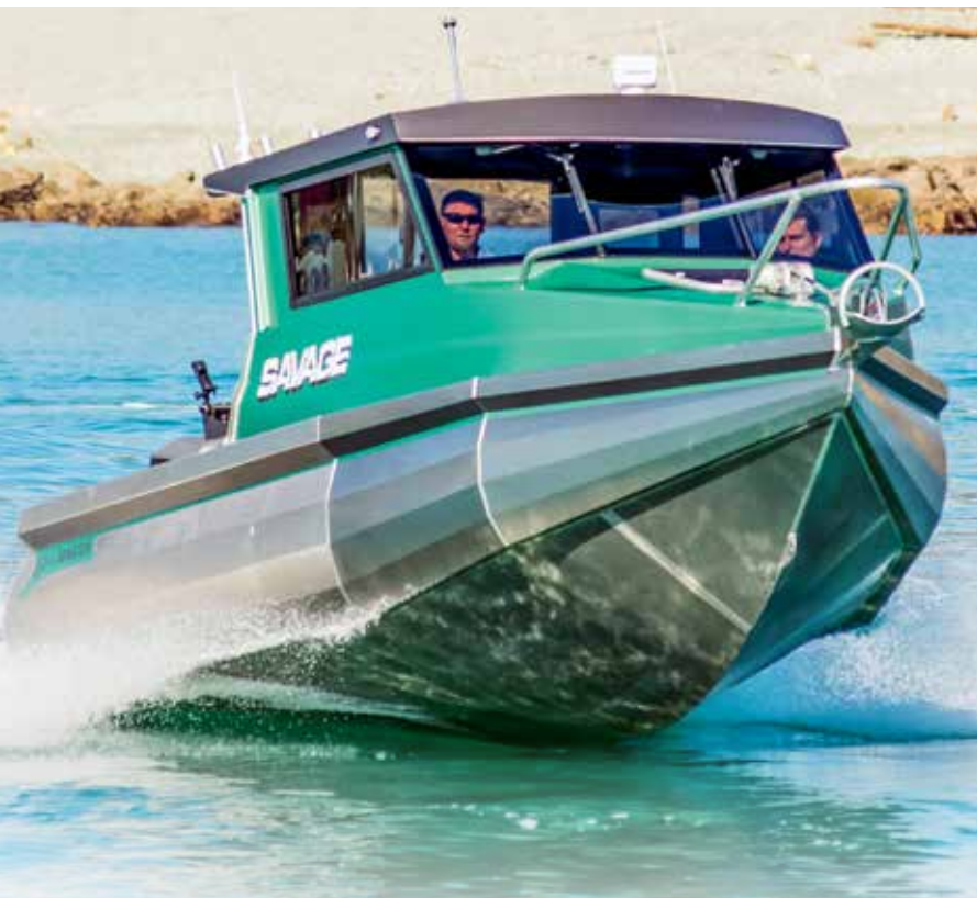
ABOVE: The Senator RH770's hull works well, smoothing out a short chop and tirelessly eating up the miles on its regular trips out to D'Urville Island. RIGHT: Simrad electronics include a powerful 1kW transducer.

deadrise means there is plenty of chine in the water to keep it steady at rest.