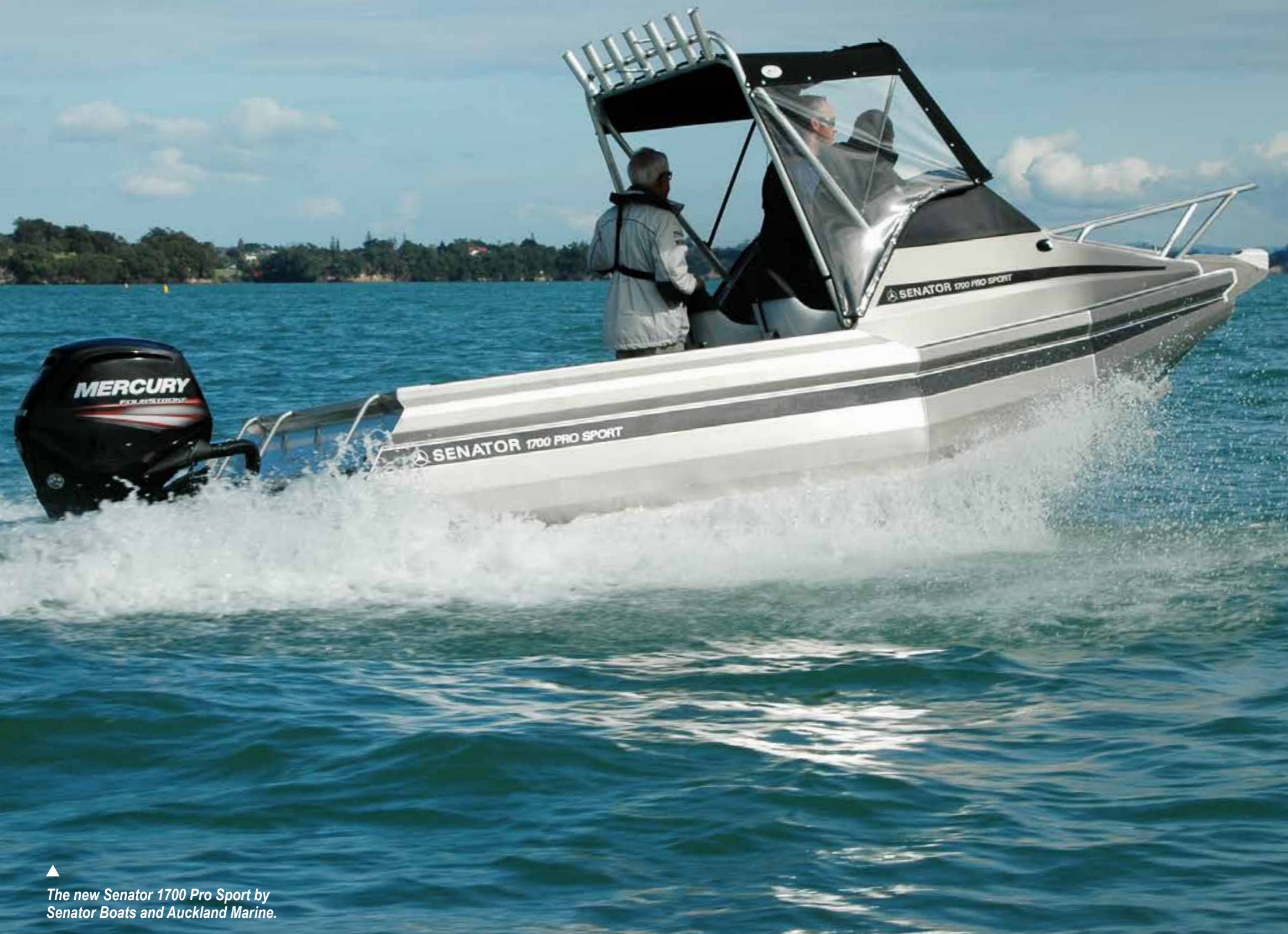
▲ The new Senator 1700 Pro Sport by Senator Boats and Auckland Marine.