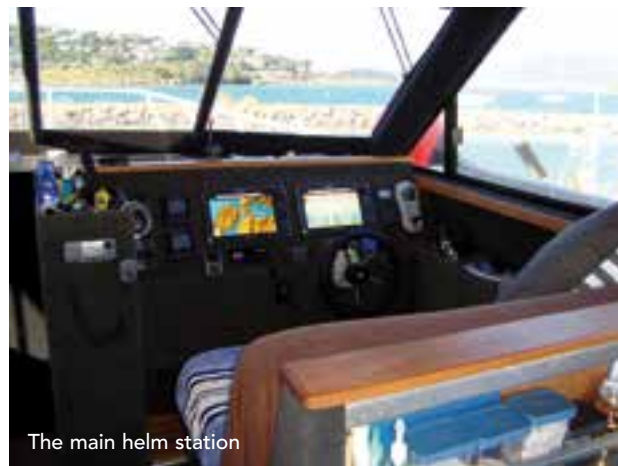
The main helm station

BlackJack II is a custom-built vessel for a Wellington-based