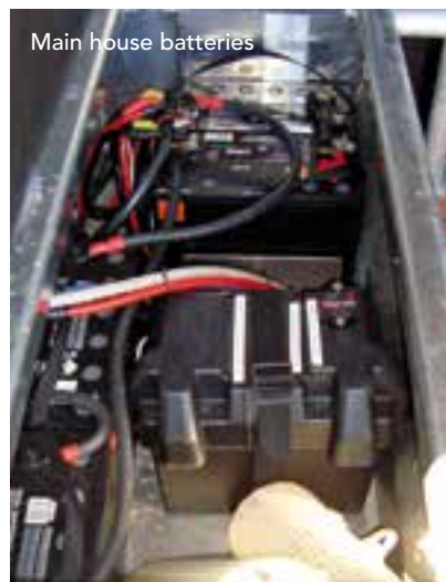
Main house batteries

The interior décor is quite shaded and dark, which is pleasing and easy on the eyes. It's also easy to clean and makes a comfortable environment for