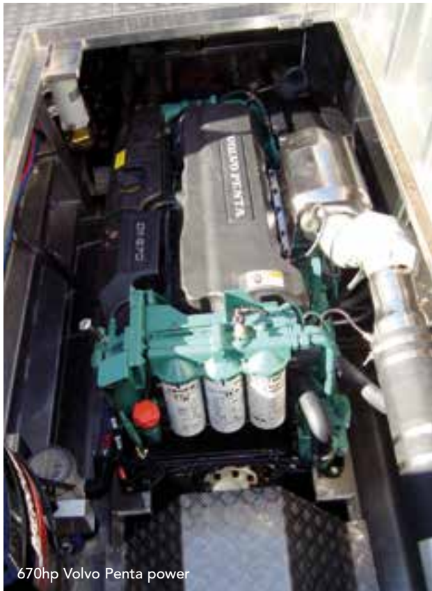
670hp Volvo Penta power