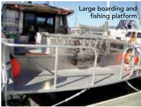
Large boarding and fishing platform