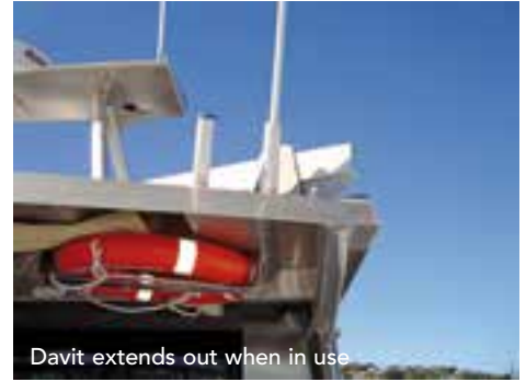
Davit extends out when in use