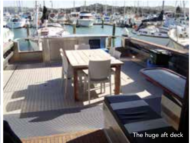
The huge aft deck

for the external dining area and a large stainless steel barbecue built into the port side.